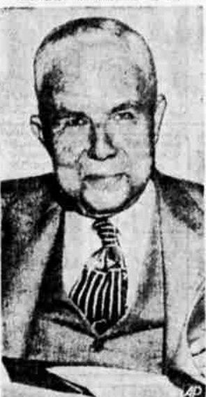
Paris El Khouri of Syria, one of the seven Arab nations fighting against Israel, assumed chairmanship of the United Nations security council at Lake Success, N. Y., at the time the council was seeking to end the Arab-Jewish fighting in Palestine.

Secure your future by enlisting in the United States navy.