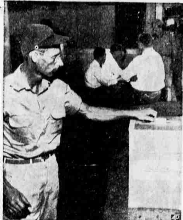
An unidentified atomic plant worker deposits his ballot as other workers vote before clerks at the Oak Ridge, Tenn., atomic plant. The workers voted to reject a "final" work contract offer, 731 to 25. The contract proposal for a 10-cent hourly increase in pay was submitted by Carbide and Carbon Chemicals corporation, operator of the Oak Ridge laboratory for the atomic energy commission.