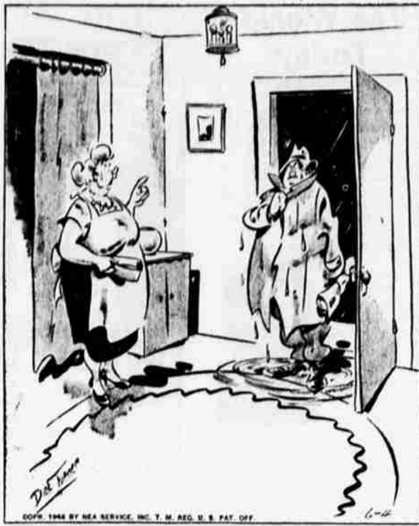
"I'm glad you're home, dear! While your clothes are wet will you see what you can do about that drain in the basement?"