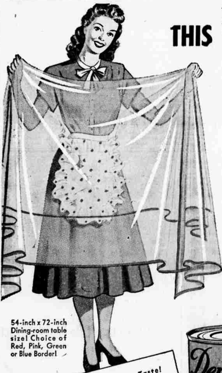
54-inch x 72-inch Dining-room table size Choice of Red, Pink, Green or Blue Border!

Yes! In stores all over America housewives gladly pay more than three times as much for this heavy-duty Clear Plastic Tablecloth Cover! It's the big 54-inch by 72-inch dining-room table size, with reinforced hem—and it means less laundry because it's stainproof, acidproof, waterproof and sanitary! Don't worry about hot dishes marking it, either... because it resists heat up to 150 degrees! This useful Tablecloth Cover is of such exceptional quality that it is unconditionally guaranteed for 5 years not to dry out or become brittle! You'll want to send for several of them at this amazing "give-away" price!