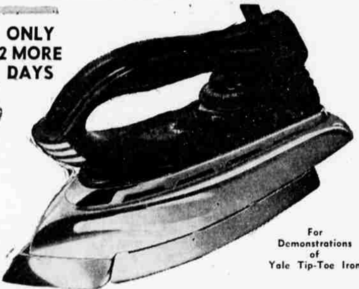
For Demonstrations of Yale Tip-Toe Iron