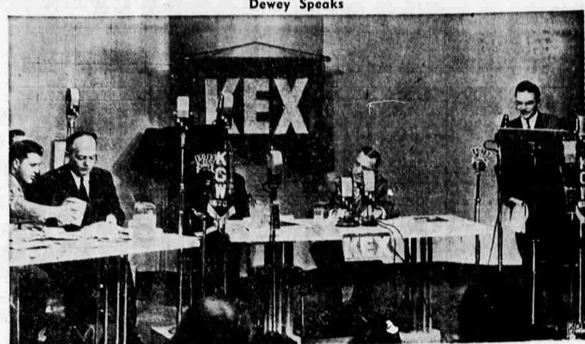
Gov. Thomas E. Dewey (right) of New York debates with Ex-Gov. Harold Stassen (second from left) in their nationwide radio debate on the communist question. The debate originated in a Portland, Ore., radio station.

The show, without charge, is under the auspices of the International Harvester company. Dancing, juggling, comedy, musical and magician's acts are to be shown.