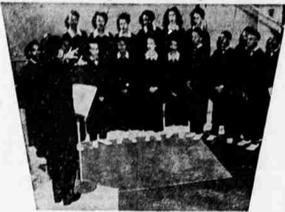
The Wings Over Hollywood choir, famed all-Negro singing group, will sing at the First Methodist church Sunday at 4 p. m. The public is cordially invited.