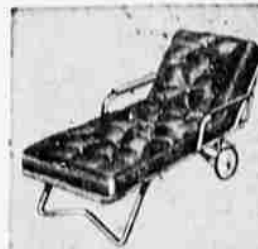
Chaise Cot and Pad

Upholstered in heavy ridgcurl mohair. Famous double coil spring construction. Handsomely styled. Built for years of comfortable sitting and sleeping.