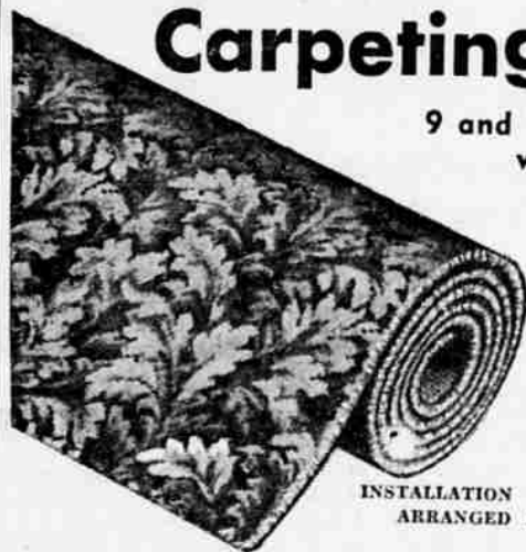
INSTALLATION ARRANGED FOR