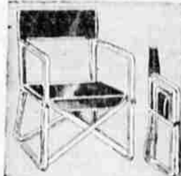
Metal Deck Chair

Ideal beach or lawn chair. Sturdy hardwood frame smoothly sanded—varnish finished. Gay striped canvas seat and back. 40 inches high.