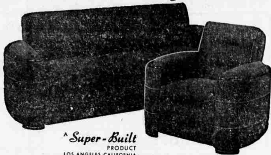
A Super-Built PRODUCT LOS ANGELES, CALIFORNIA