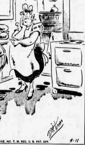
"Maybe if I put on my slippers and got settled down with my book in an easy chair, you could remember what it was you wanted me to do!"