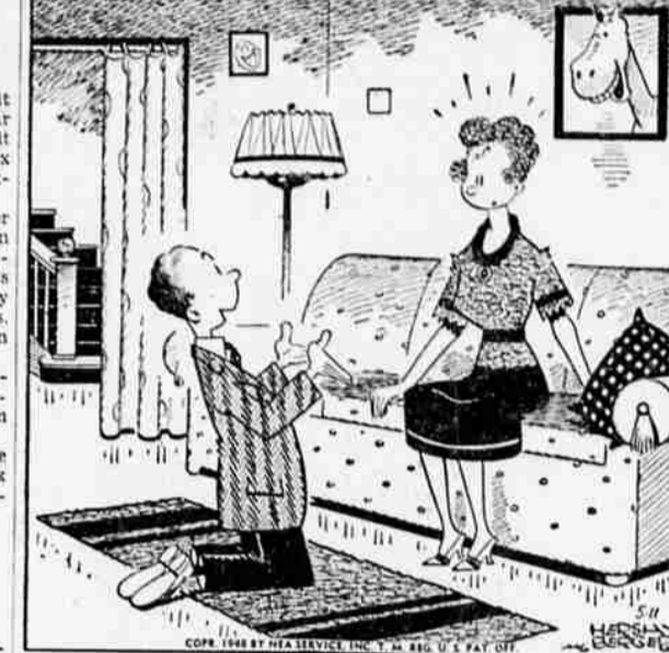
"What if you can't cook? I haven't enough income to buy groceries anyway!"