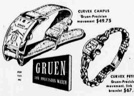
CURVX CAMPUS Gruen-Precision movement $49.75

Yes, the Important Gifts Come from Rickys