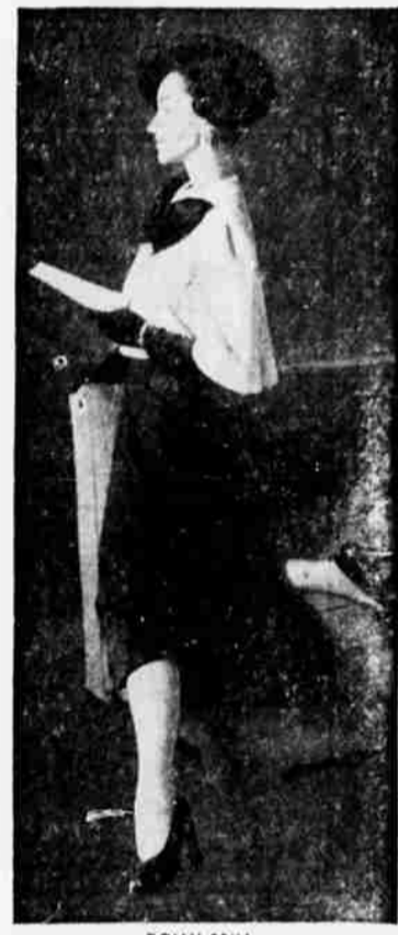
DOLLY BRILL Cover Cover Girl