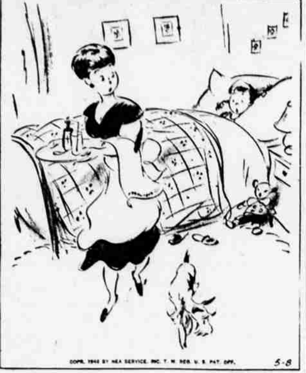
"There's only a month of school left—do you think after I get over this chicken pox it would be worth going back?"