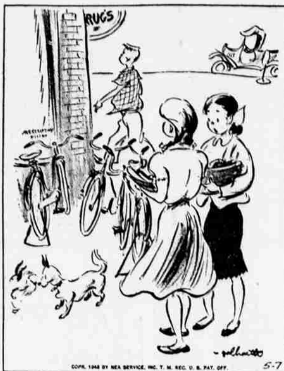
His parents are going to send him to military school because he is so wild—he does hang around the drugstore an awful lot!