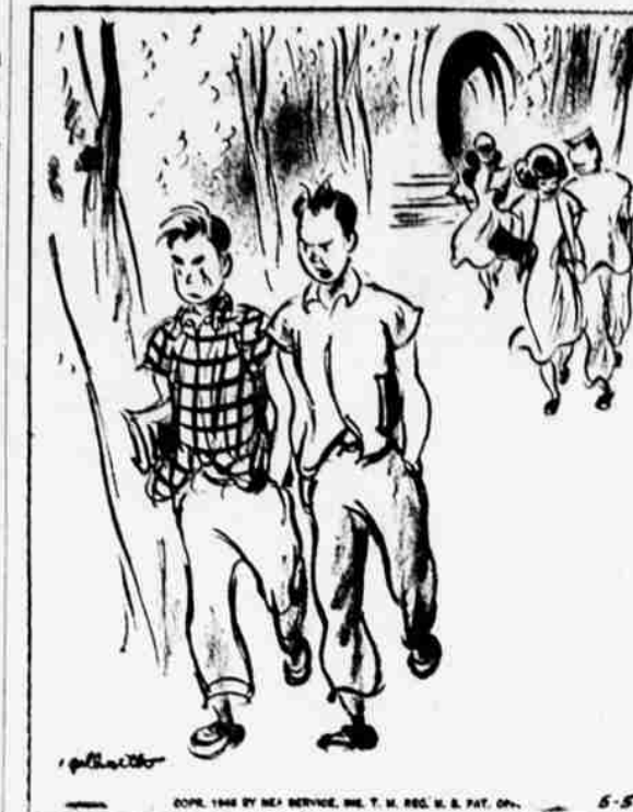
"Why don't they teach us Russian instead of Latin and Greek? If I'm going to be a politician, some day I'll have to tell Stalin and Molotov where to get off!"