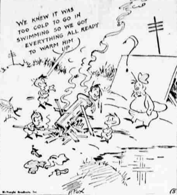
"WE KNEW IT WAS TOO COLD TO GO IN SWIMMING SO WE GOT EVERYTHING ALL READY TO WARM HIM UP."