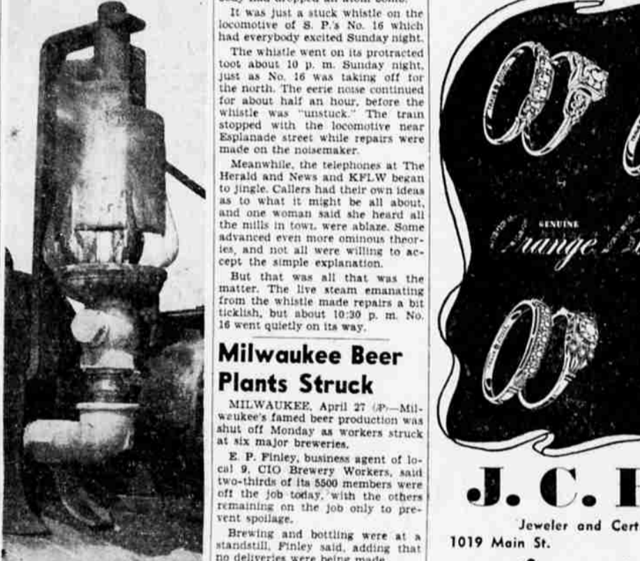
This is the kind of whistle that caused all the commotion last night.