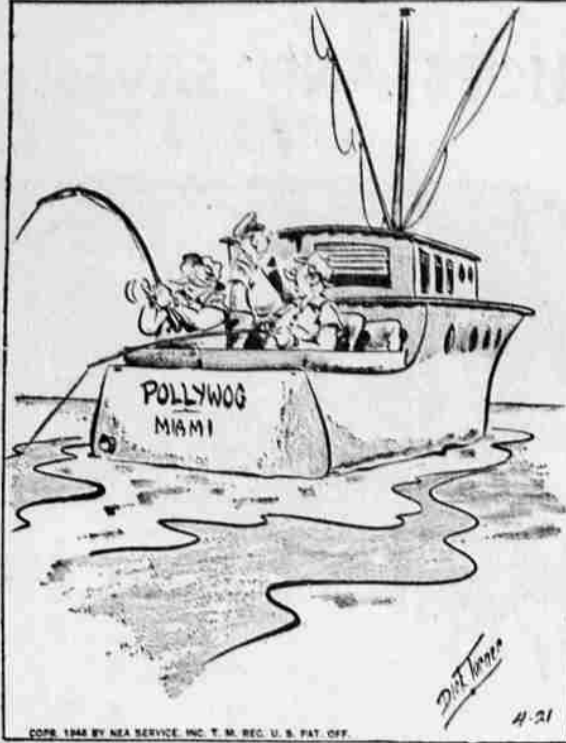
"Confound it, Webley! I came down here to get rid of the worries of the manufacturing business! Must you holler 'strike' every time you get a bite?"