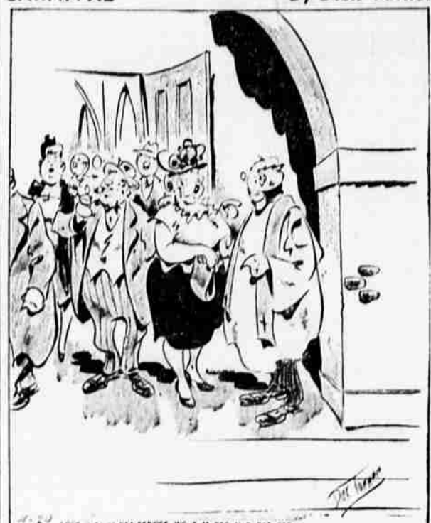
"About loving our enemies—do you mean cabbage worms and bean beetles, too?"