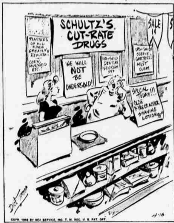
"Y'know, Myrtle, for one and a half cents I'd close up shop today and go fishing!"