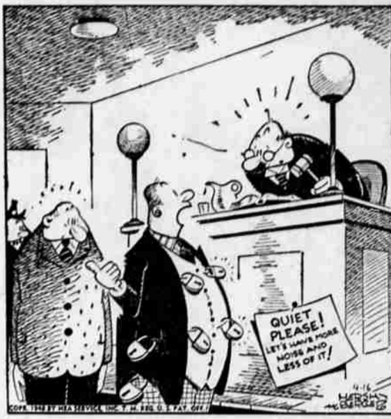
"He's accused of pocketpicking, and I'm defending him!"