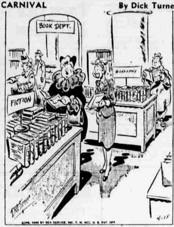
"Here's one that ends happily! After a terrific legal battle the wife wins a divorce with alimony!"