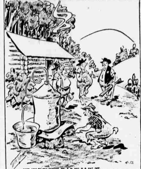
"So you want to know how we can sell it for eighty-five cents a gallon if it ain't moonshine? Well, we don't advertise!"