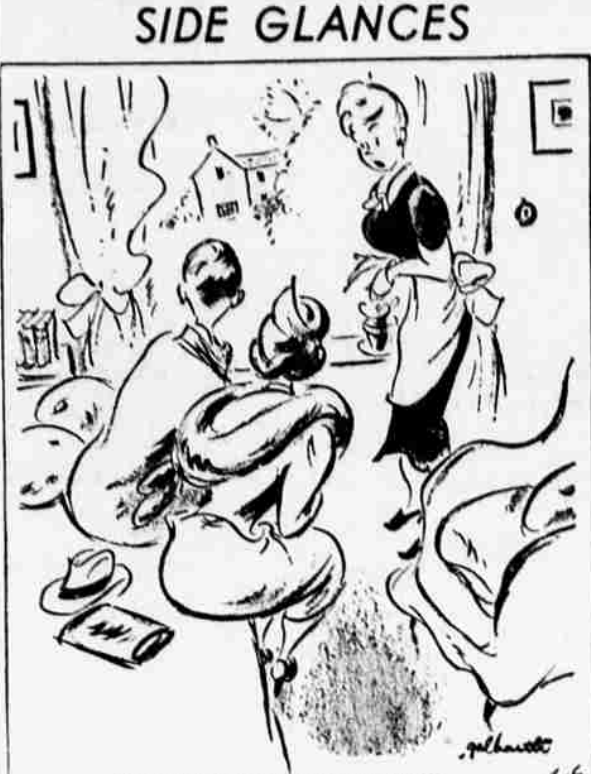
"They've been fighting for a week, so when she dashed out today with a grip I thought sure I had a house for you—but it was only laundry!"

FASHION CLEANERS SPECIAL 4-HOUR SERVICE 7-DAY REGULAR SERVICE 129 S. 7th Phone 5563