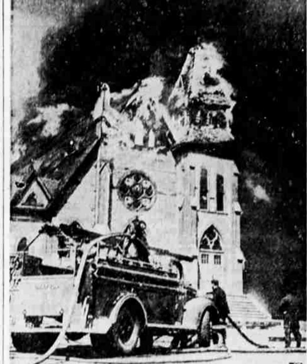
Firemen struggle to get hose lines into play as flames burst from steeple and roof of the 51-year-old St. Mary's Catholic church at North Grafton, Mass. Damage was estimated at $75,000 to the wooden structure.