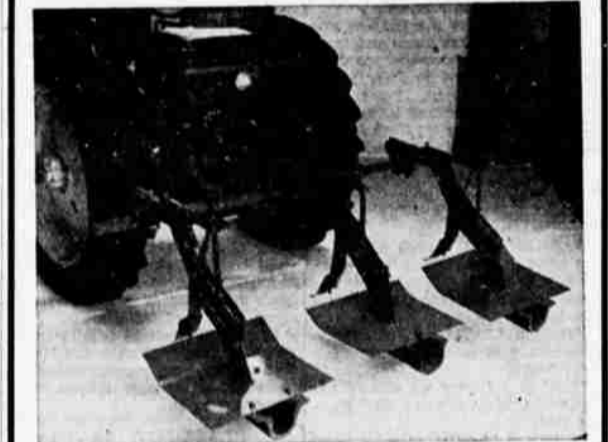
Corrugator attachments for single tool bar.