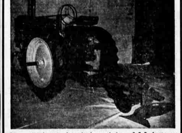
Plow attachment for single tool bar. 1-2-3 bottoms available.

This tool carrier is used successfully in many farming operations such as corrugating, plowing, cultivating, discing and transplanting. Available soon . . . see us for complete details.