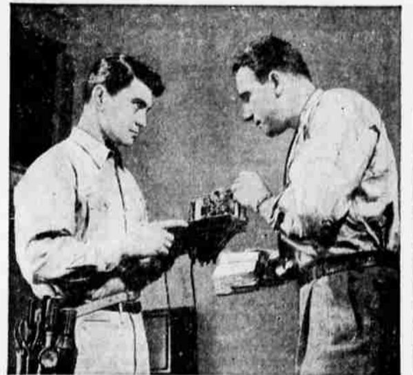
2. If you became an installer you'd start, most likely, in a training school. With pay, of course... $37 or $38 a week. Then regular increases for eight years after you got on the job. You'd be given other training, too... to help you learn your way up the ladder. Most all the top men in the company came up that way.