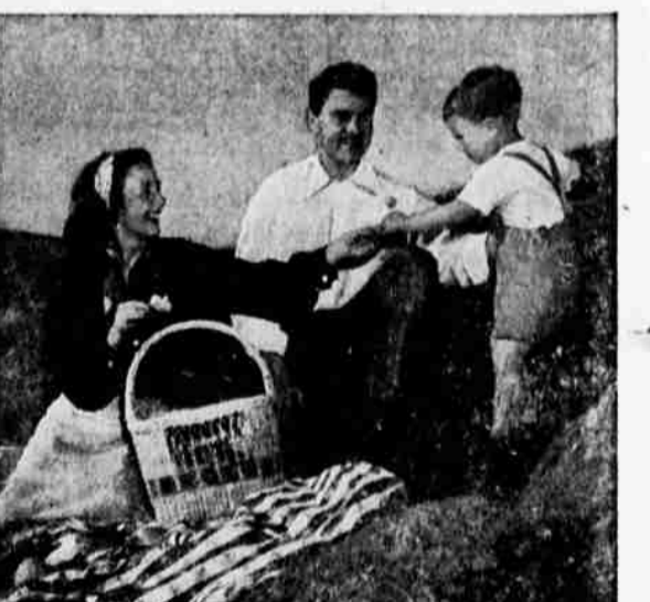
3. Fun like this is more fun when your job's secure. And you can count on telephone work. There's a fine benefit plan, too, paid for entirely by the company. It covers sickness, accidents and death, and provides a helpful pension. There's nothing like the peace of mind a telephone job gives you... at work or at play.

4. Telephone jobs must be good jobs to attract the capable people needed to furnish good service. Good pay, steady work and an employee benefit plan give a strong sense of security. Comfortable surroundings, vacations and friendly fellow workers help make work pleasant.