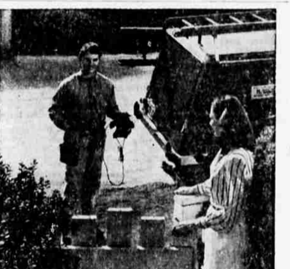
1. Some of the busiest fellows in town... Pacific Telephone's installer-repairmen. For we're adding a lot of new telephones every day in the West. It's steady work. And the pay? Latest records show top rate men average about $80 a week for 42 hours. The younger men graduate up to the $80... according to experience.