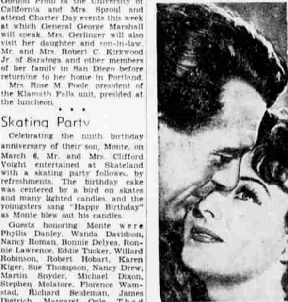
HE BUYS A WOMAN

Later, the hostess served refreshments to the mothers present.