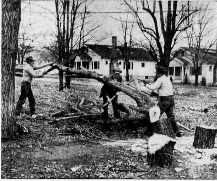
Folks passing by the triangular park at Esplanade and Eldorado this week observed workmen cutting down a few of the larger trees and with the customary inquisitiveness of tree lovers, wanted to know "why?" City Engineer E. A. Thomas explained that roots from the poplars were clogging up the sewers in that area and that there were more trees than necessary in the small park. The park board crew removed the trees.