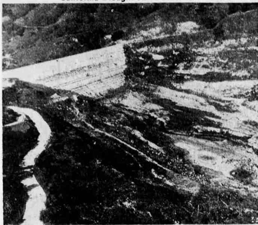
Normally the Almaden reservoir (above) near San Jose, Calif., is filled with some 50,000 acre feet of water at this time of the year. Today Almaden creek is a trickle on the bottom of the reservoir. This illustrates the effect of the lack of normal winter rainfall on the coastal water reserves in the San Francisco bay area.