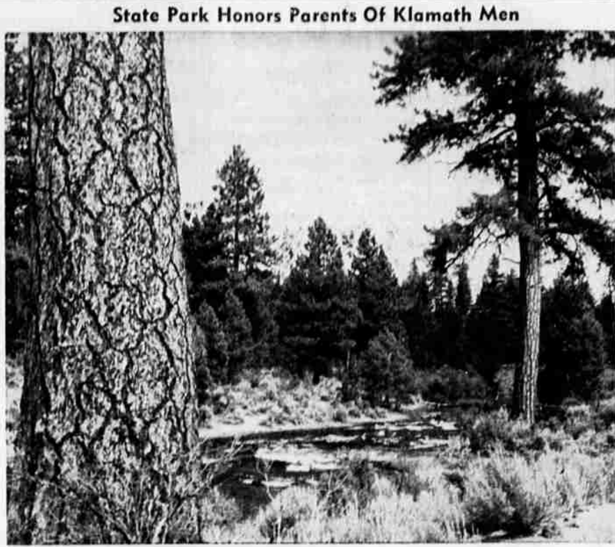
State Park Honors Parents Of Klamath Men