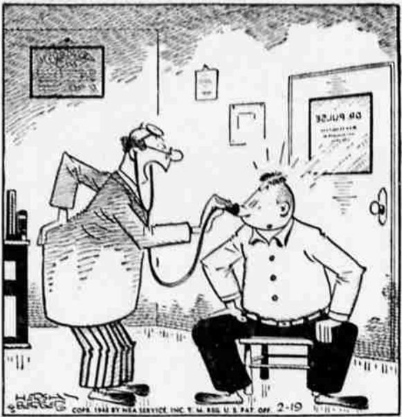
"I hope you don't mind—I've always wanted to do this!"