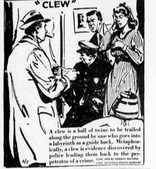
A clew is a ball of twine to be trailed along the ground by one who goes into a labyrinth as a guide back. Metaphorically, a clew is evidence discovered by police leading them back to the perpetrator of a crime.

So there are plenty of reasons why Russia wants Korea and intends to get it if the trick can be done.