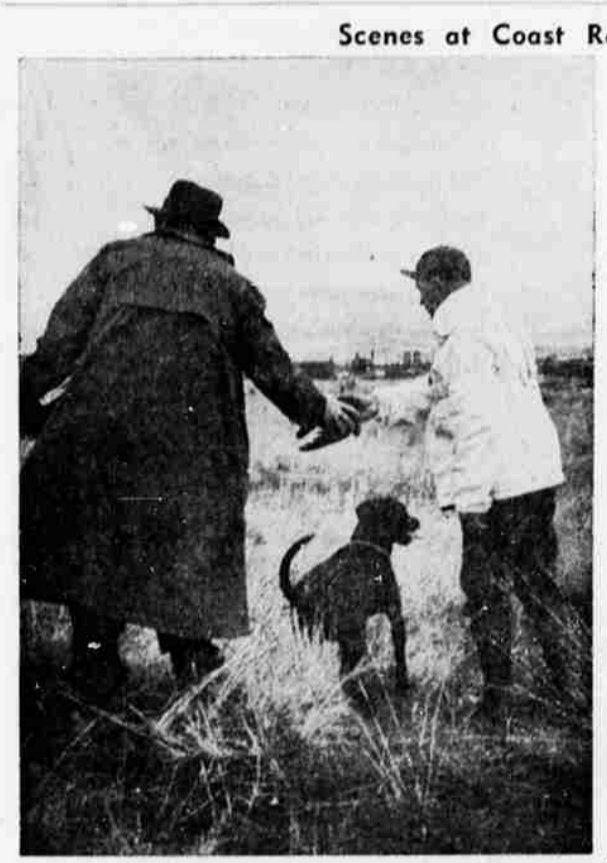
Scenes at Coast Retriever Trials Here