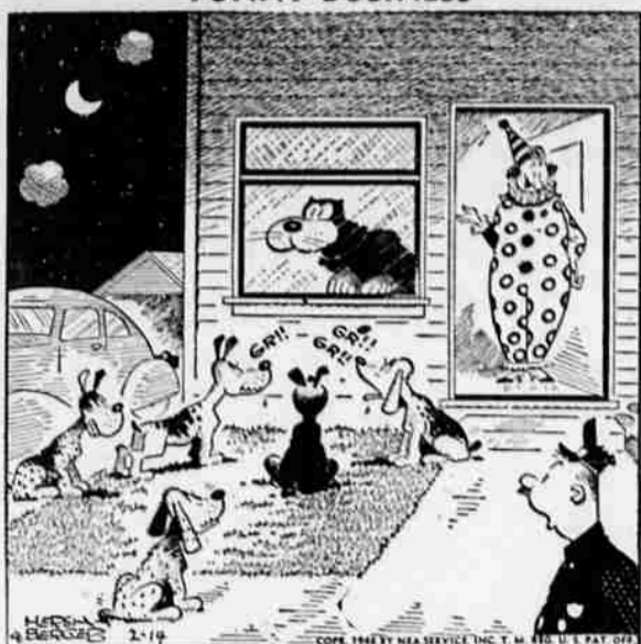
"It's a swell masquerade outfit, but he can't get to the car because of the dogs!"