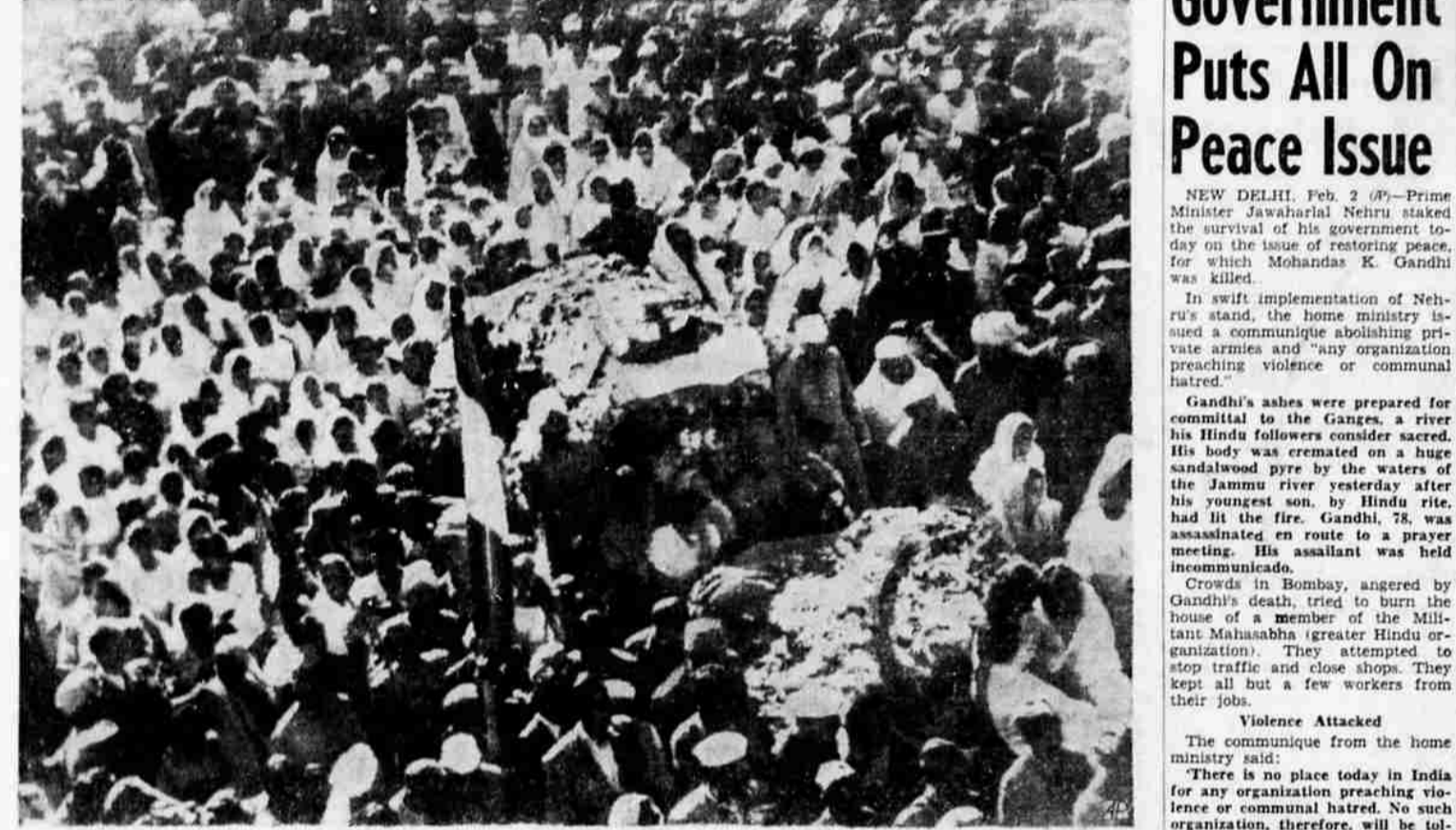
The body of Mohandas K. Gandhi (center), covered with rose petals, is carried atop an automobile to the cremation scene in New Delhi as groups of worshippers join the procession.