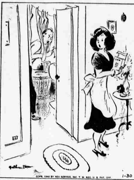
"Stockings in the bathroom again! The trouble is since we're married you've started to act like you were at home!"