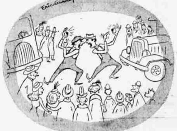
"No—it's not a fight, they're just swapping Pepsi-Cola 'Treasure Tops'!"

Witty Reason The voice of Shaw, like that of Tithonus, does flow on unceasingly. But there the resemblance ceases. The voice is witty, reasoned and forceful—still speaking the clearest King's English of any Irishman since Dean Swift. Although Shaw is a self-professed physical coward, his life has been one of endless battles, most of which he ended himself—and he still has it's steak-eating or vivisection, both of which he's agin. A barnum of the highbrows, no man ever praised himself harder and few ever lived up to their own estimate more. He didn't actually say he was a better dramatist than Shakespeare. He was more subtle—he just rewrote Shakespeare to show how he could be improved. Puckish and elfin as ever, this acidulous Santa Claus, having outlived two generations of critics, is composing another drama in his ninety-second year and still finding time to engage in postcard debates on religion with American college students. He is currently Broadway's highest paid dramatist. His "Man and Superman" revival is outdrawing that upstart Shakespeare's "Antony and Cleopatra" by $7000 a week—and Shakespeare is being helped by Katharine Cornell. Most of the $4000 a week Shaw gets from capitalistic America goes to support the socialist austerity of Britain, but socialism is what he