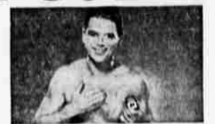
average baby's skin. Regular and Extra Strong for grown-ups.