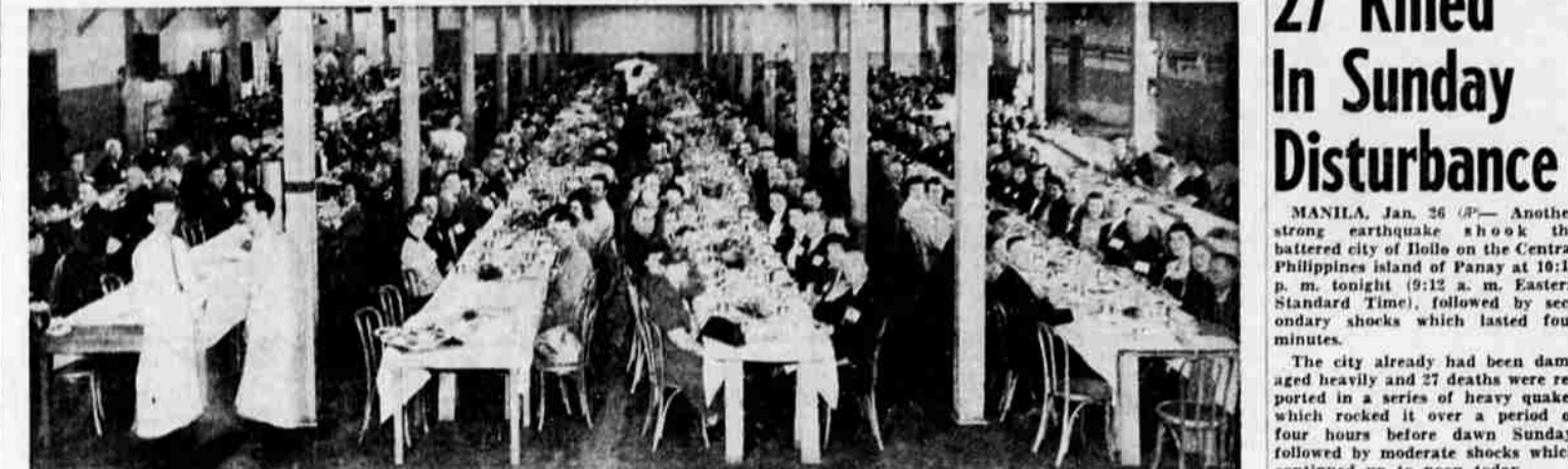
This picture shows the dining hall at Oregon Vocational school Saturday when 469 farmers from four counties of Oregon and California gathered there for the 14th annual meeting of the Klamath Production Credit association.