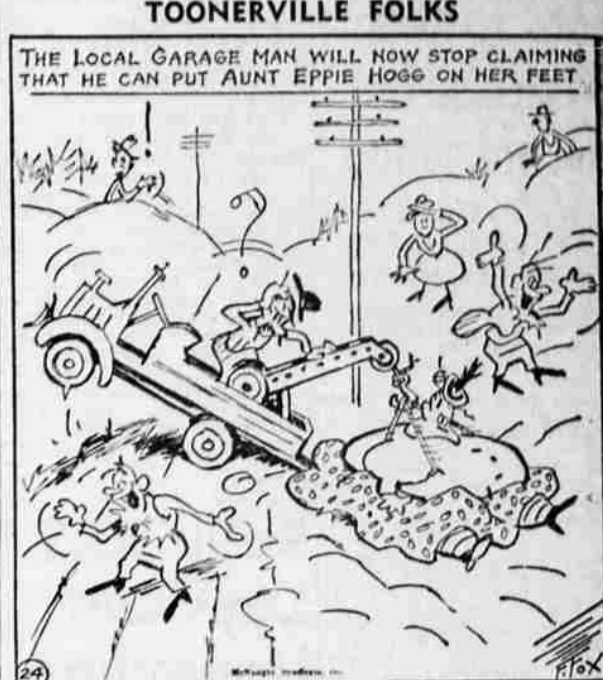
THE LOCAL GARAGE MAN WILL NOW STOP CLAIMING THAT HE CAN PUT AUNT EPPIE HOGG ON HER FEET.

Have your cars and trucks serviced while doing your shopping at the Y market.