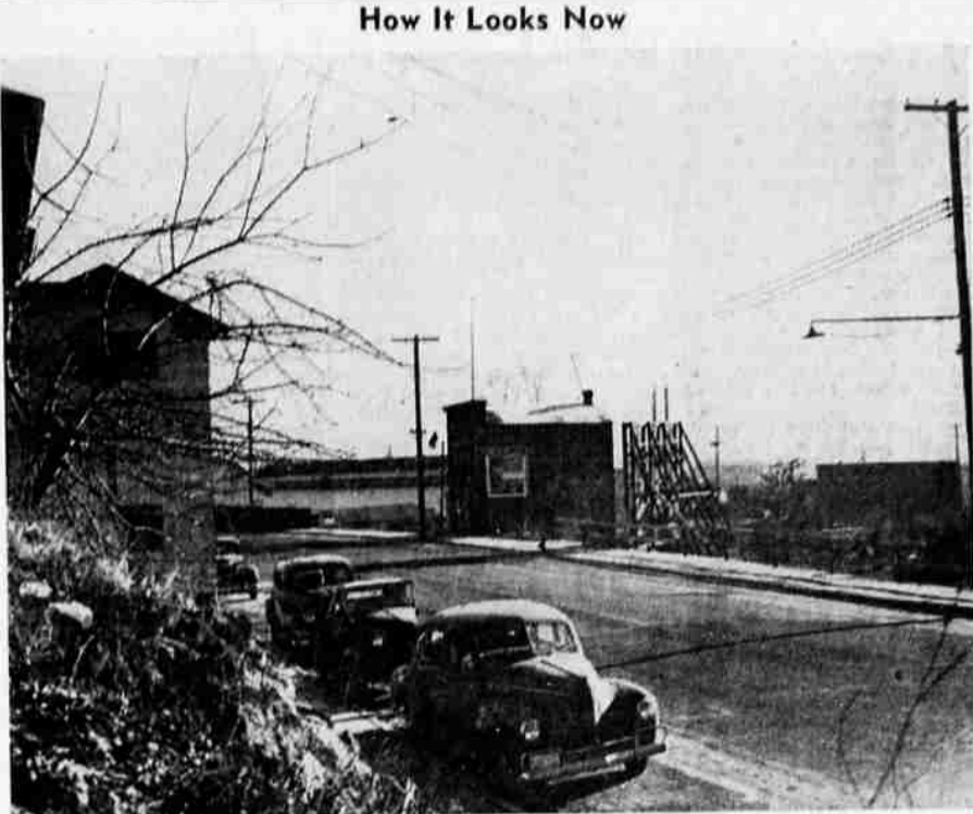
Above is a picture taken about the point where the photographer stood who made the "Photographic History" shot to be found on today's back page. It will be noted that Klamath Falls has not rebuilt its business district on the site of the old one—it has moved away from it. Only building now stands on the opposite side of the street, which was there when the old picture was made, about 1905, is the stone structure seen above.