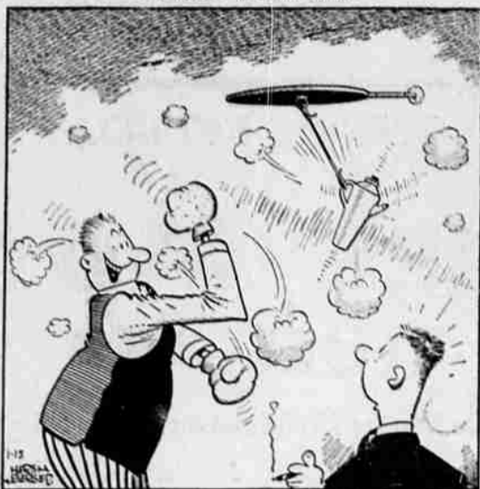
"I get a lot of good exercise as well as a swell cocktail!"