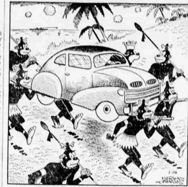
"They said to drive it easy for the first 1000 miles!"

GI Northern Pfd 40, Int Harvester 89 1/2, Int Paper Pfd 89 1/2, Johns Manville 39 1/2, Kennecott 47 1/2, Long Bell "A" 24, Montgomery Ward 52, Nat Dairy 17 1/2, N Y Central 28 1/2, North Am Co 14 1/2, Northern Pacific 20, Pac Am Fish 14 1/2, Pac Gas & Elec 35 1/2, Pac Tel & Tel 95 1/2, Pan American 9, Penney J C 40 1/2, Payotier 28, Raytheon Pfd 34, Reynolds Metals 22 1/2, Richfield 16 1/2, Safeway Stores 16 1/2, Sears Roebuck 35 1/2, Sinclair Oil 17 1/2, Southern Pacific 47 1/2, Standard Brands 37 1/2, Standard Oil Cal 20 1/2, Stud Baker Corp 10 1/2, Sunshine Mining 15 1/2, Union Oil Cal 25 1/2, Union Pacific 16 1/2, United Airlines 24 1/2, United Aircraft 76 1/2, U S Steel 26 1/2, Warner Bros Pic 12 1/2, Westing Elec 28 1/2, Woolworth 46 1/2.