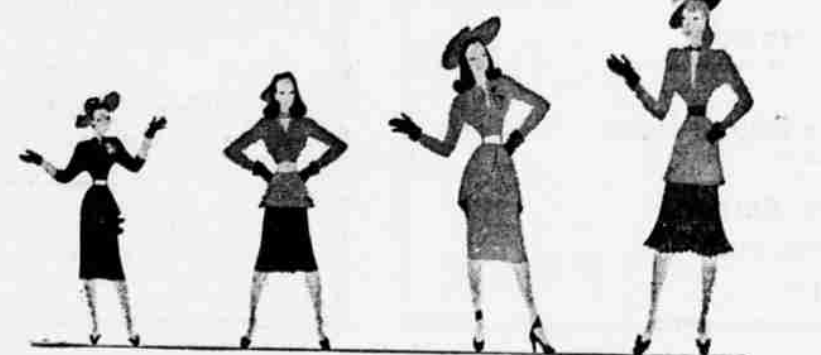
DEMI for short, slender-type legs TRIM for slender-type legs MODEL for medium-type legs STATELY for ample-type legs

Now we have them for you, those wonderful Round-the-Clock nylons that are pre-made to measure in a wide range of patterns to fit every leg type. Regardless of your height, regardless of your weight, there's a Round-the-Clock pattern to fit you like a second skin. With your very first pair of Round-the-Clocks you begin a beautiful new hosiery life. They're guaranteed to fit perfectly, pair after pair after pair. Try them soon, in one of the exciting new Round-the-Clock shades.