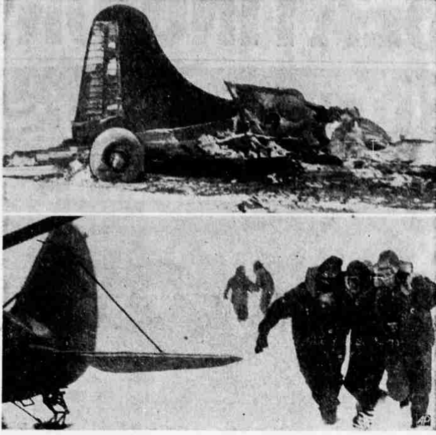
Only the tail section and pieces of burned wreckage (top) remained after an army B29 crashed 85 miles north of Nome while on a training flight, but it was home to six of eight fliers aboard for a week until two daring Alaska bush pilots in small planes made their rescue. Below one of the fliers is being helped to one of the rescue planes. These pictures were made by Rud Richter, Nome photographer who accompanied the rescue planes, in 30 to 40 degree below zero weather. The pictures were then flown to Seattle.