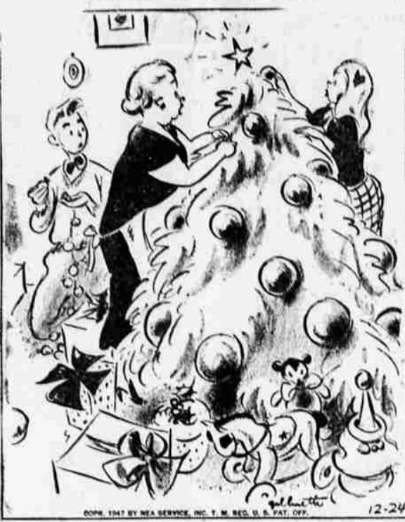
"Your father grumbles about all the fuss we go to, but be sure to put his presents out in front so he won't knock the tree down getting to them!"