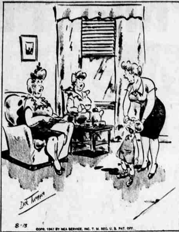
"Oh, it's nothing—he's just fussing! He says you're sitting on his chocolate cake!"