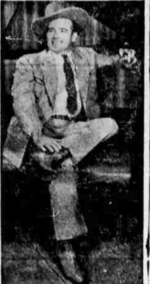
Bob Wills and his Texas Playboys will make their second appearance of the season in Klamath Falls this Thursday night at the armory. Dancing will be from 9 p. m. to 1 a. m.

"That Genial King of Western Swing," Bob Wills, and his Texas Playboys, will make their second ap-