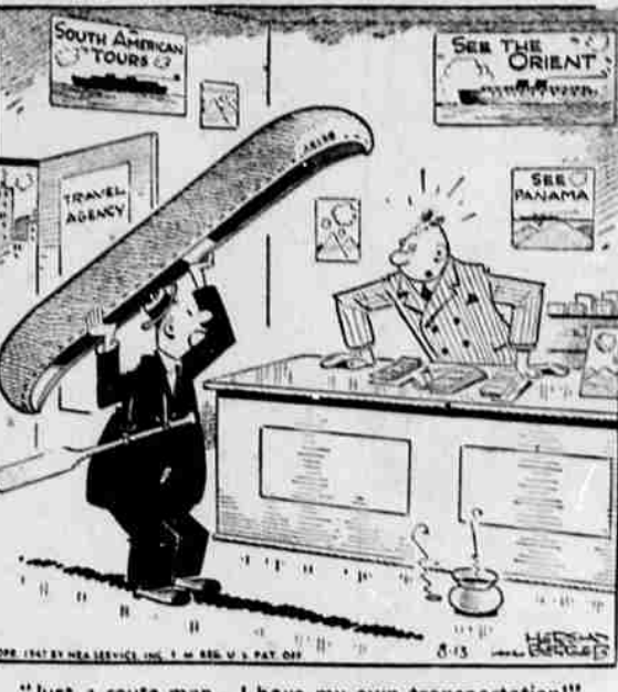
"Just a route map—I have my own transportation!"

lines; slaughter ewes mainly steady, spots unevenly higher; most good and choice slaughter ewes 10.00; common to medium throats 7.50-9.00; few good and choice black-faced mixed 2, 3, and 4-year old breeding ewes 10.50.