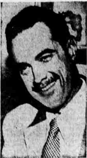
Showing many expressions, but only one mood—angry—Howard Hughes was snapped in those poses during a hearing in Washington, D. C., involving his war-time plane contracts.