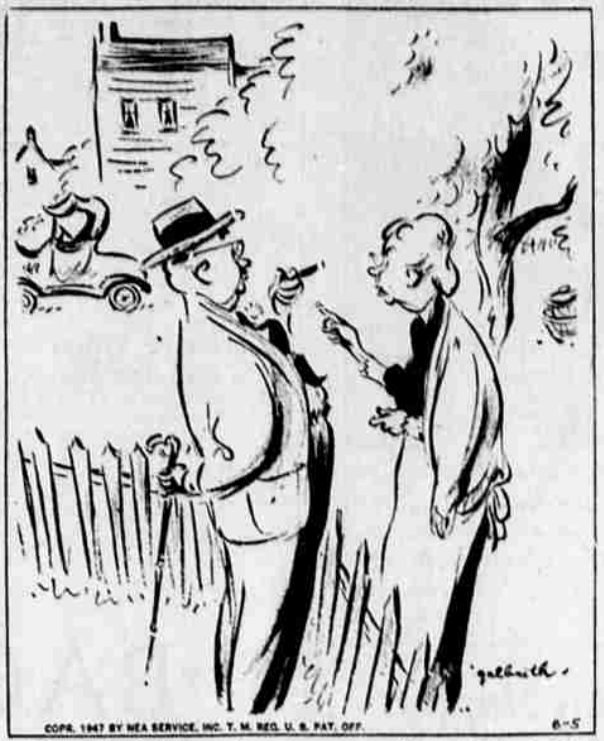
"Yes indeed, I remember you very well as a boy—but I hope you didn't come all the way from New York just to pay for that window you broke with your slingshot!"