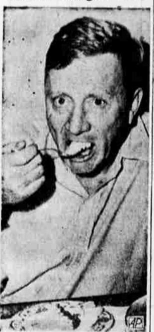
Supreme Court Justice William O. Douglas, who had his tonsils removed at Portland, Ore., resumes eating shortly before he was to leave hospital for his Wallowa Mountains summer home.