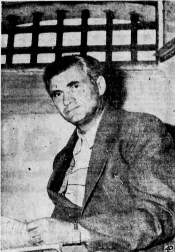
Fritz Wiedemann, former German consul-general at San Francisco, sits in cell in town jail at Pfarrkirchen, Germany, where he awaits trial before a denazification court.