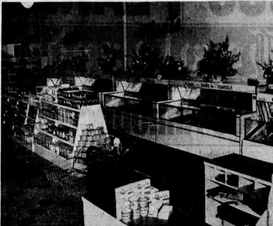
This view shows the new, self-service refrigerated meat counters in the recently remodeled Palace Market.