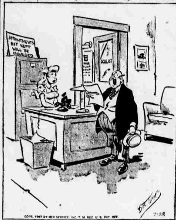
"Oh! I see what you mean when you said my eyes tested twenty-twenty—twenty for the oculist and twenty for his consultant!"