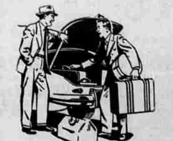
TUCK AWAY PLENTY! Roomy luggage compartments hold plenty — and high-lifting lids make it easy to get at any piece.

After all, we can't do much about getting one to you till you make your wishes plain. You do that simply by placing your order — which will get equal consideration whether or not you have a car to trade.